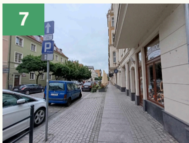
7 Continue straight Szewska street.