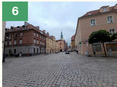
6 This is where Ślusarska Street turns into Szewska Street.