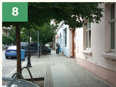
8 Until you reach a blue gate.