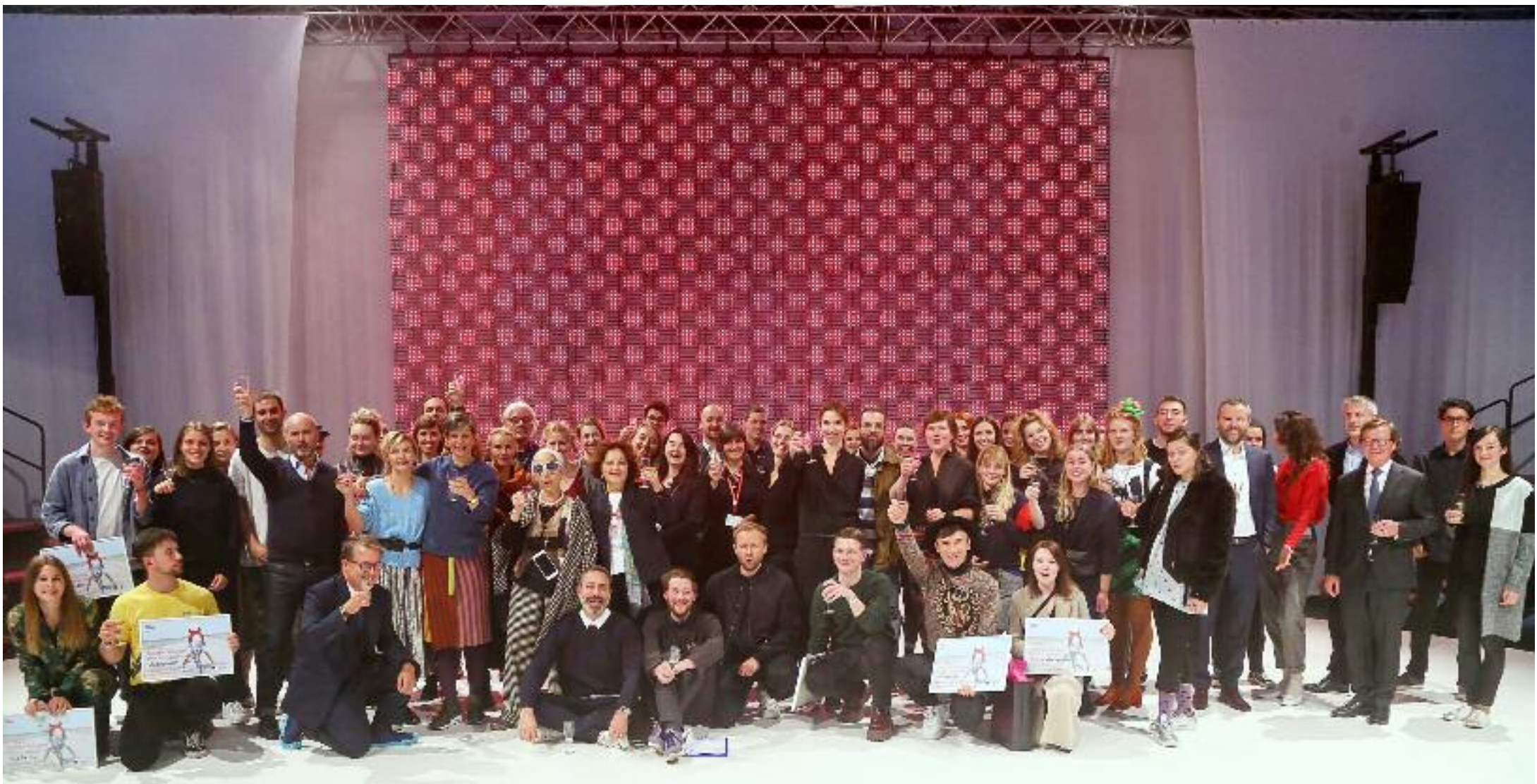
Diploma Selection 2018